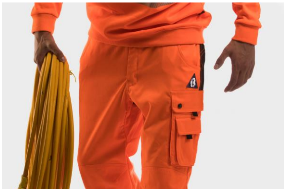
Not only visually attractive, but also functional: smart-CHROMOTION by smart-TEC

Additionally, the customer can personalise any Debrunner product marked with an NFC chip. Again, all he/she has to do is read the NFC chip with his/her smartphone. It takes just a few clicks to personalise the work jacket with information about the owner such as name, size, and type of work clothing or similar. Confusion is avoided and customer loyalty is strengthened at the same time. With the help of smart-TEC's NFC technology, Debrunner Acifer has successfully mastered the art of combining design, functionality, safety and quality.