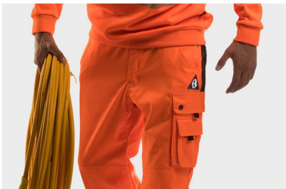
smart-CHROMOTION emblem sewn onto high-quality workwear by Debrunner